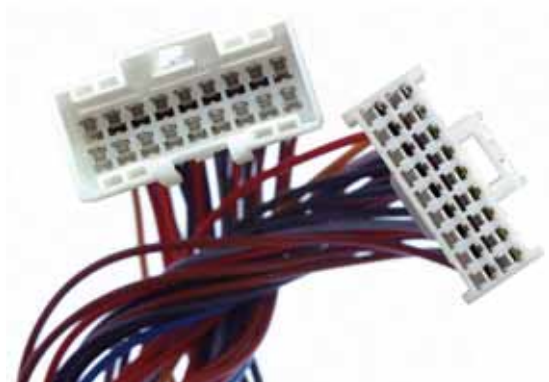
MG 623937 / MG 613936